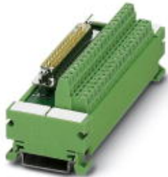
VARIOFACE module, with screw connection and D-subminiature pin strip, for assembly on NS 35/7.5, 9 positions

Please be informed that the data shown in this PDF Document is generated from our Online Catalog. Please find the complete data in the user's documentation. Our General Terms of Use for Downloads are valid ( http://download.phoenixcontact.com )