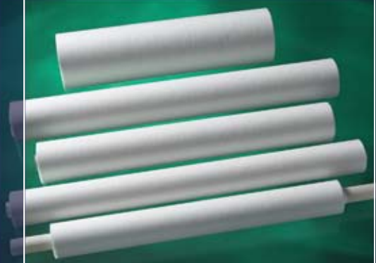
Easy Braid's Stencil Rolls

Easy Braid Co. is a manufacturer of desolder wick with an emphasis on continuing advancement in desoldering technology. Established in 1989, Easy Braid Co. quickly achieved widespread recognition in the rework/repair industry with its competitive pricing and innovative product line.