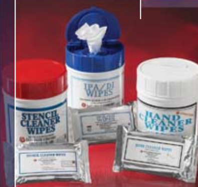
Easy Braid's Wipes